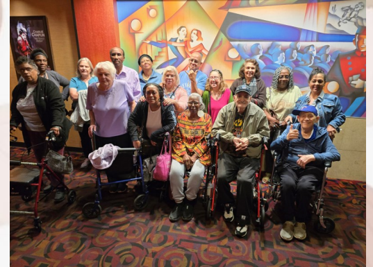
Above: We enjoyed watching The Naked Gun at the Stroud Mall movie theater!