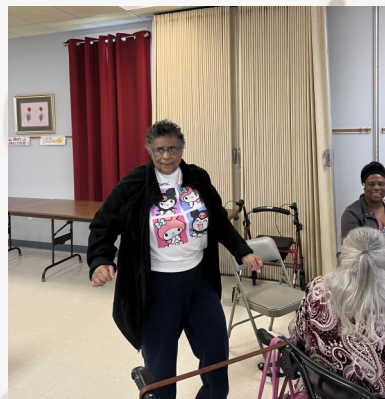
Below: Chestnuthill Senior Center attendees dancing